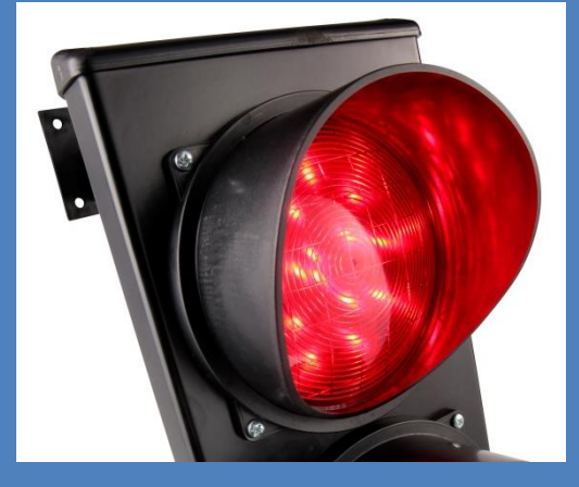
Illuminated red light