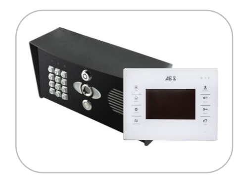
STYLUSCOM-IMPK-PE-US (Pedestal Model)