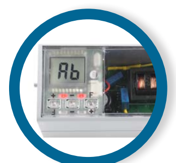
Programming display with 3 keys

Thanks to the accurate selection of mechanical and electronic components, the A951 automated system can silently drive leaves weighing 100 kg and 1100 mm wide on continuous duty ensuring the absolute operating safety at any time offering significant energy savings both during stand-by and when operating.