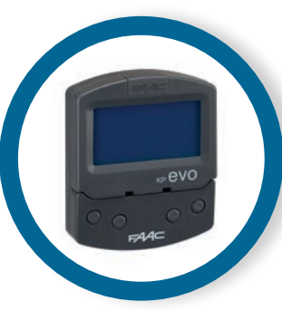
KP EVO Keypad