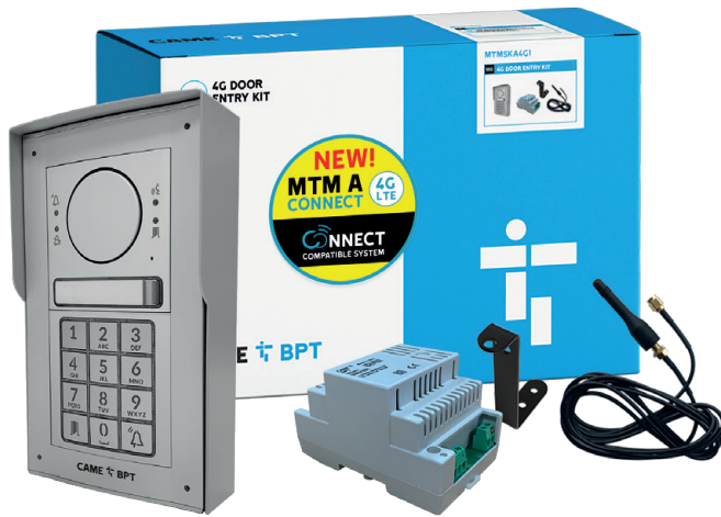
Surface kit shown - includes rainshield